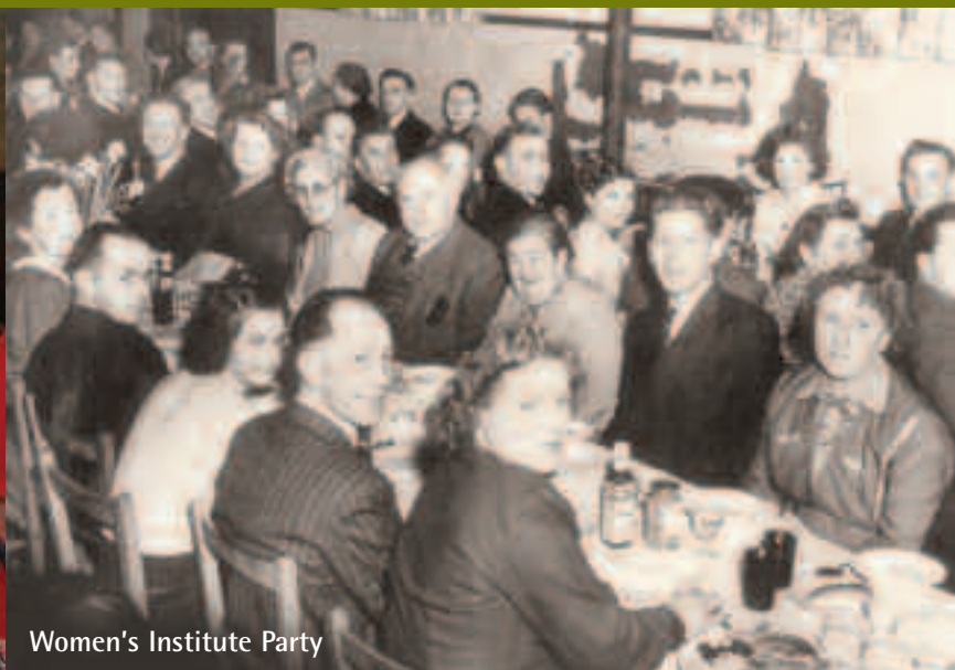
Women's Institute Party

St Botolph's church has been at the centre of village life for over a thousand years. Despite much change in the village and in society as a whole, St Botolph's retains that role today: contributing to village life and bringing people together regularly to celebrate in weekly worship, baptisms, weddings, funerals as well as the traditional festivals of the church.