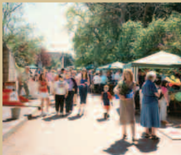
Church Gala Day

On the Sunday nearest to the saint's day, 17 June, the church celebrates the saint's life. Botolph was a gifted leader and helped many to find faith and serve God.