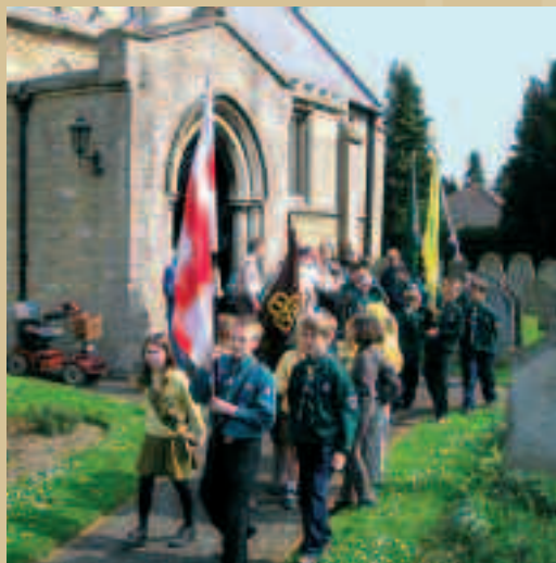
St George's Day

Church services are held every day during Holy Week. Easter Eve is marked with a bonfire, in a special grate. From this the Paschal candle is lit and taken into the darkened church to light candles for the congregation. Easter Day is the highlight of the church year, with music and flowers celebrating the resurrection of Jesus.