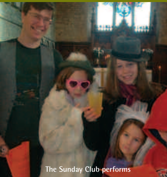
The Sunday Club performs