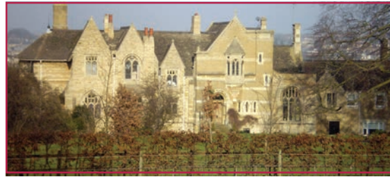
The former Priory College

ditching in the fields by the roadside" while he was "lolling in a coach". He said he felt like a stranger in his own skin.