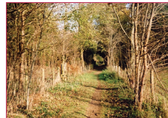
Warren Road beside Wothorpe Groves

4 Cross the road and look for the footpath next to "Long Acre". Again the path is between hedges. After a foot bridge and a gate the path crosses diagonally over a grass field to a gate in the corner adjacent to the sports pavilion. Ignoring paths to left and right, continue over the footbridge and stile until the path reaches Kettering Road. Cross the road and continue down to the car park.