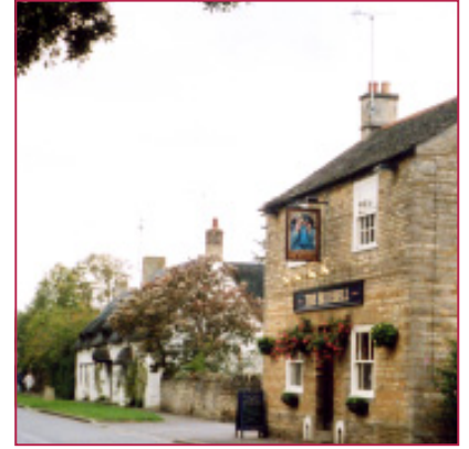
John Clare's Cottage & The Blue Bell, Helpston